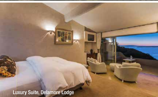
Luxury Suite, Delamore Lodge