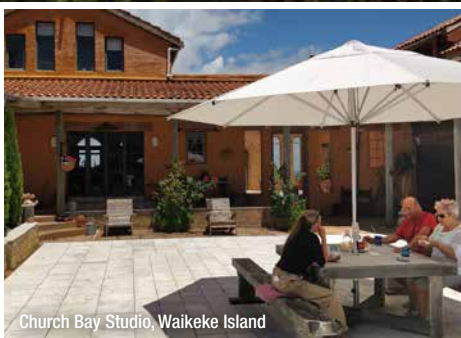
Church Bay Studio, Waiheke Island