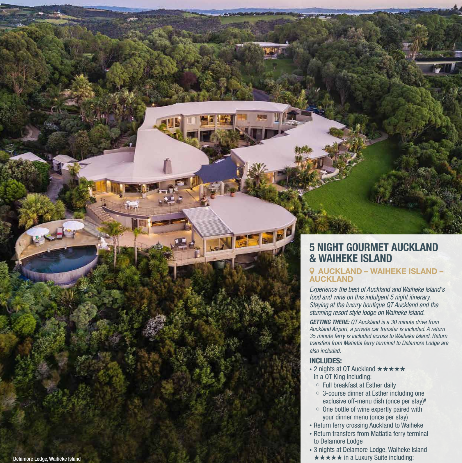
Delamore Lodge, Waiheke Island