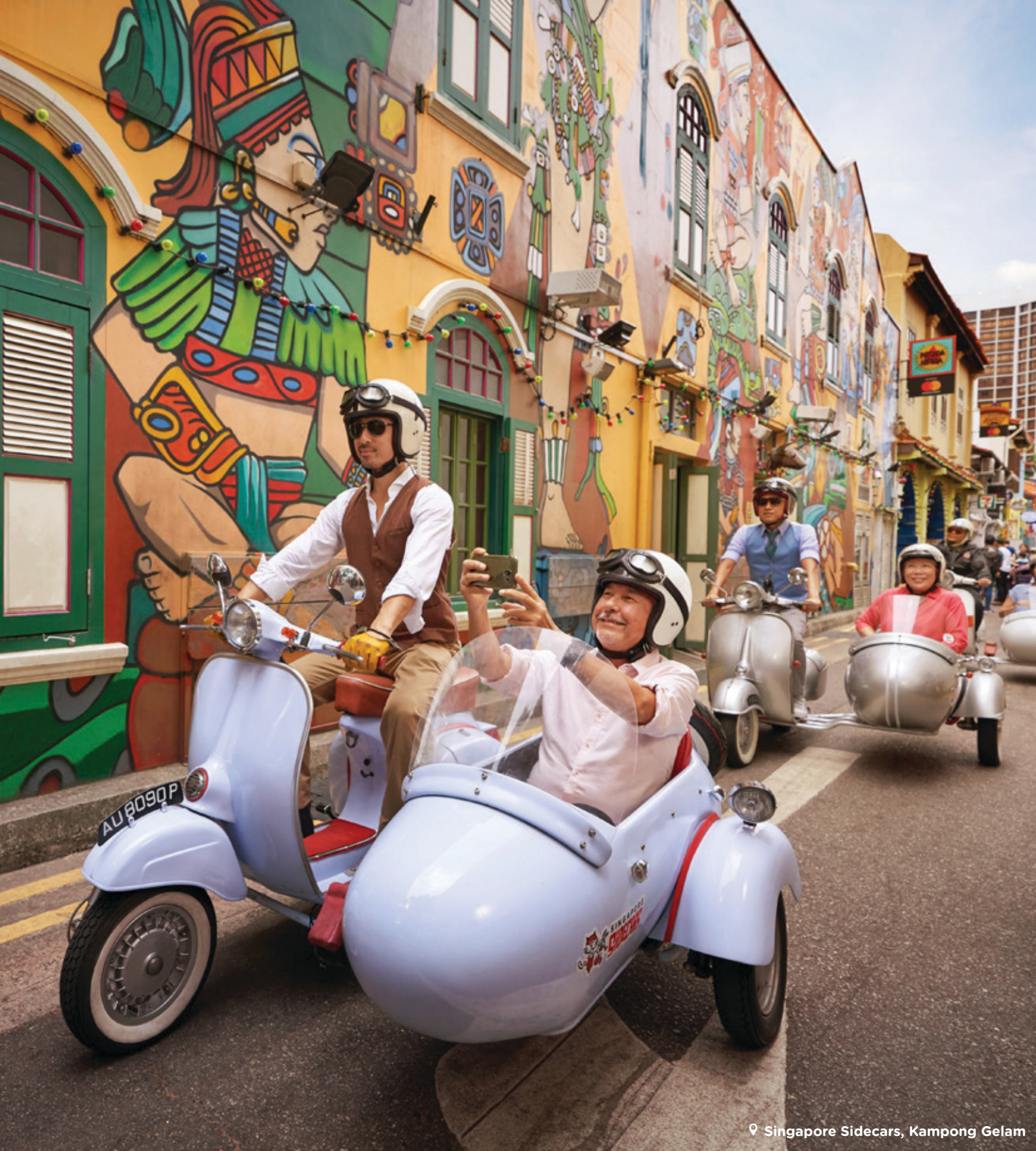
📍 Singapore Sidecars, Kampong Gelam